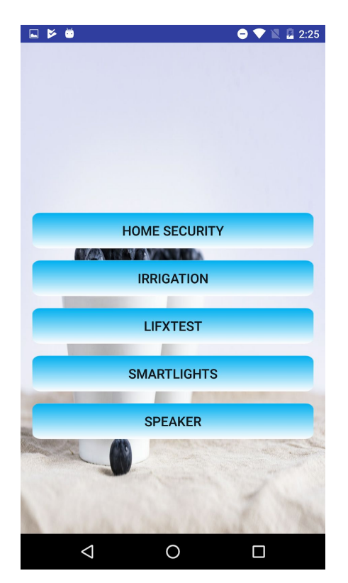
Figure 2.6.5. Supported Environments

10. Figure 2.6.5 shows the supported environments within the APPLICATIONS tab (see Figure 2.5.1 ).