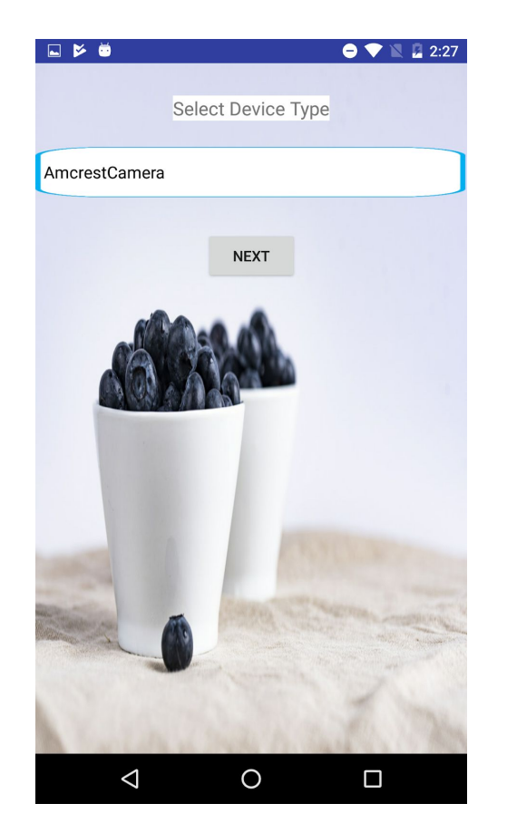
Figure 2.6.8. Selecting a Driver Device Type