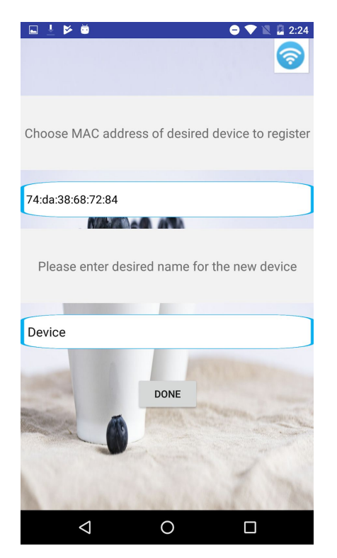
Figure 2.5.3. Setting the New Device Information

If you do not press the BACK button, the WiFi password will remain the random string so it is important to utilize the BACK button, or you may need to restart your entire process.