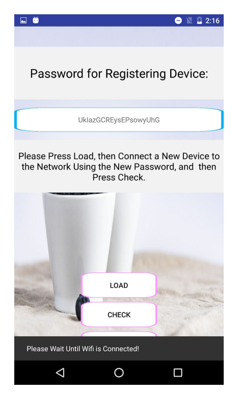
Figure 2.5.2. Registering a new IoT device